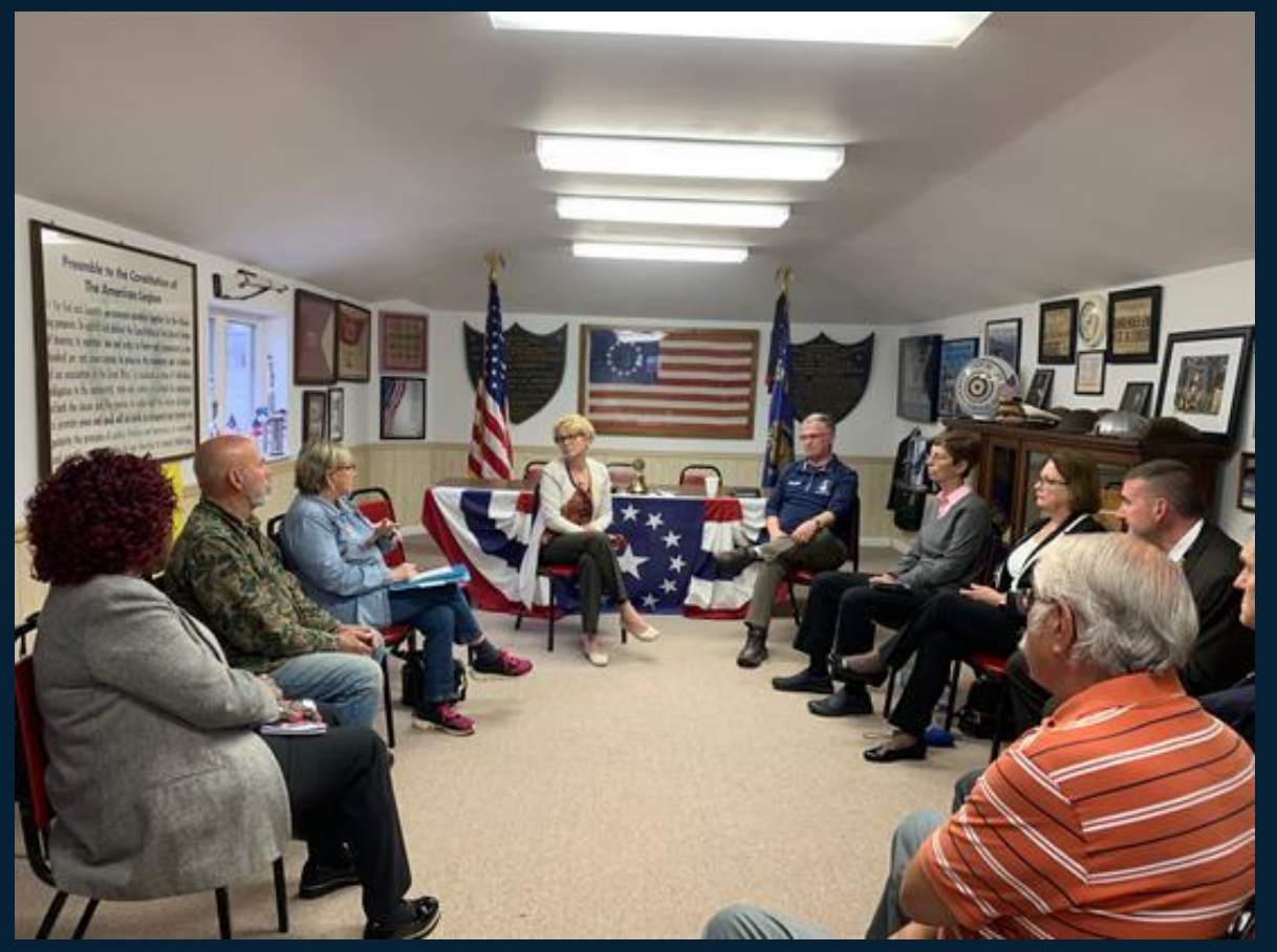
Discussion with local veterans' leaders, including American Legion Post Commanders and Chester County Director of Veterans' Affairs among others.