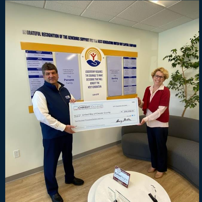
Houlaahan meets with CPF recipient, United Way of Chester County