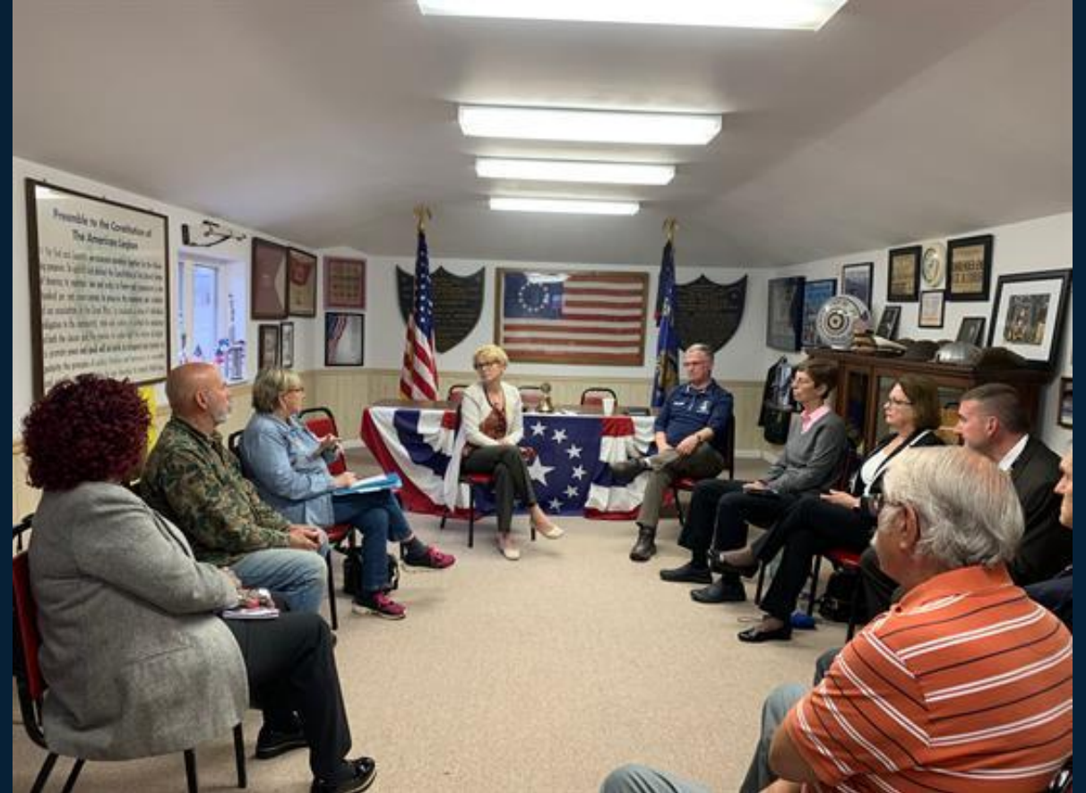
Discussion with local veterans' leaders, including American Legion Post Commanders and Chester County Director of Veterans' Affairs among others.